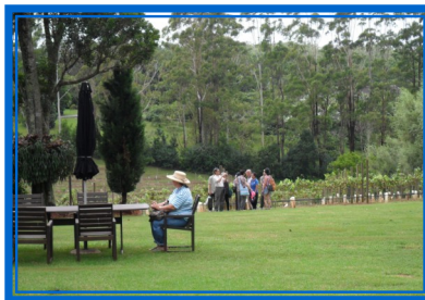
The vine yard