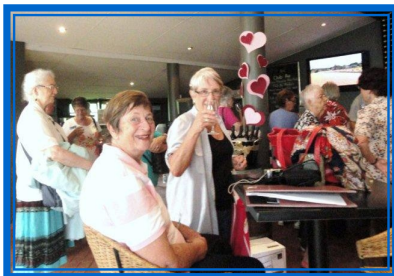
Some of the group tasting the wine

Trip to Aussie Vineyard and the Brewery: Tamborine was really beautiful and the day was a very pleasant social outing. The vineyard was very busy and a delightful setting. A number of our members chose to add to their cellar. The walk through the shops and cafes in the Gallery Walk proved to be popular with all and some of our funds were left in the shops. The brewery was a pleasant introduction to some different brews, some excellent food, great cheese and a very good pie shop. Again the setting of the venue was beautiful. It was a good day.